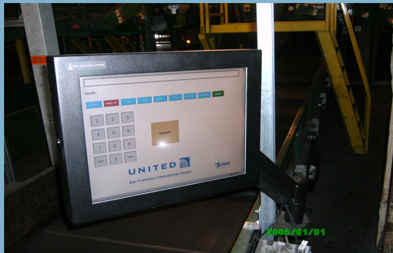
Sample of Actual Live JMR MEC Solution