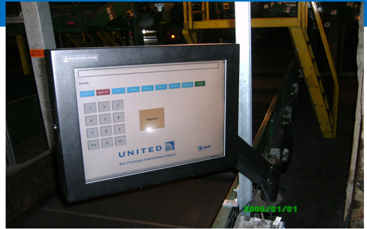
Sample of Actual Live JMR MEC Solution